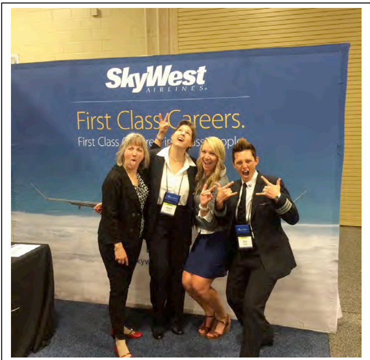
Would we hire these ladies as professional pilots?! Sure we would!